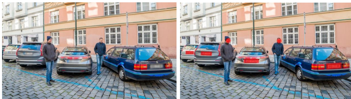
Example of anonymized image (left) and image with highlighted detections for better inspection (right).

Anonymizer SDK is a cross-platform software library designed to provide easy anonymization of RGB images. The software detects and blurs faces and/or car license plates in various scales and orientations, with support for high resolution spherical images. Package includes command line application for batch processing of images. Both one-line and two-lines license plates with EU size or similar are supported (520x110mm, 280x200mm, 320x160mm and similar). Detection of other types of license plates on request.